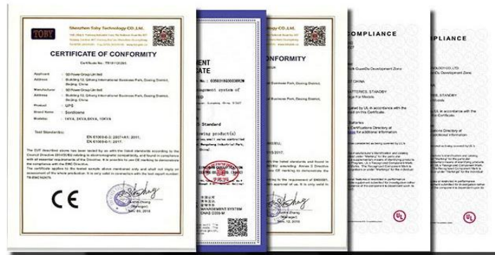
CERTIFICATION:ISO, CE, ROHS, UL, MSDS

Certifications: CE, ROHS, UL, MSDS, ISO, UN38.3, etc,